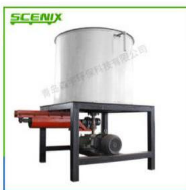
Glue mixing machine