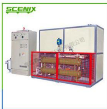
Electrical Heating Oil Heat Furnace